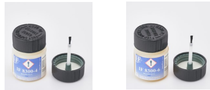
Products pictured may differ from the product delivered