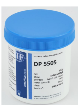
Products pictured may differ from the product delivered