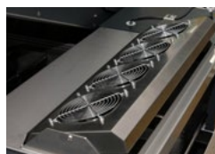
Efficient cooling in outfeed section