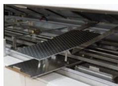
Retractable nozzle sheets for quick maintenance