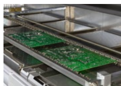
Grip conveyor for extremely thin PCB or flexfoils