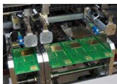
Multi track conveyor for variable PCB width