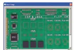
Ersa AUTOPROFILER: Easy offline profiling for highest machine uptimes.