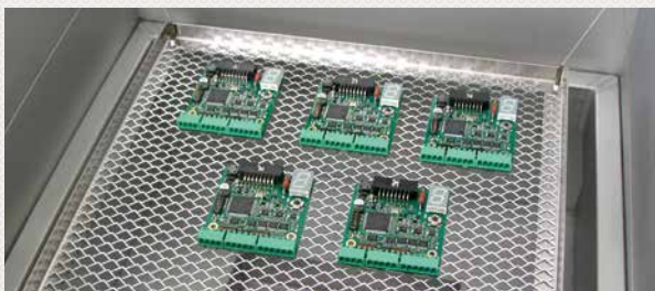
Workpiece carrier with PCB assembly in feeding position