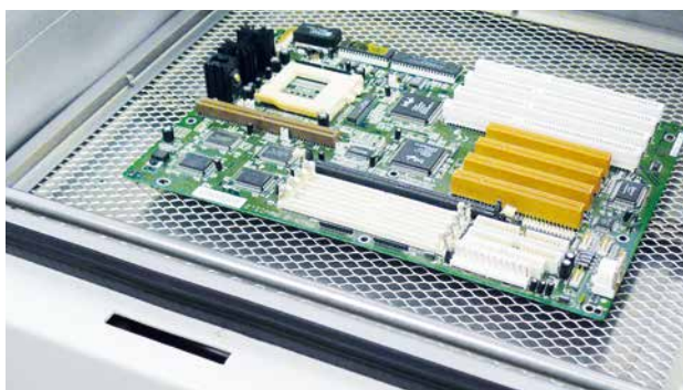
Work piece carrier with assembly at feed-in position

After opening the machine cover the solder product is placed on a work piece carrier. The process starts. An electric motor moves the work piece carrier with the assemblies to be soldered into soldering position. The PLC controls vapor production according to the set temperature gradients. Having reached the soldering temperature the work piece carrier is moved to the cooling position. The inner lock between process and cooling zone closes. The solder product is cooled by an effective blower system. After the cooling time has expired, a signal indicates release for removing of the work piece. An electromechanical guard locking prevents from opening the machine during production process.