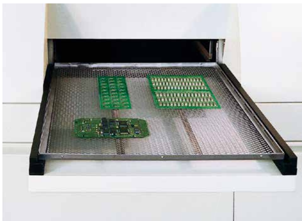
In-feed with Work-Piece Carrier and a variety of assemblies

This ensures a homogeneous energy distribution for the whole assembly. Therefore three-dimensional assemblies may be processed without any problem.