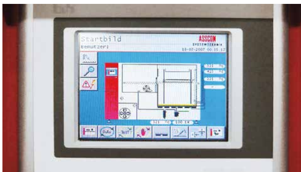
Operational Panel (Colour-Touch-Screen)

The machine's controller unit is located in an integrated control case and comprises switch, control, regulator and safety/fuse elements for all function units. The process is controlled and monitored with a failure message system via microcontroller with colour-touch-screen and intelligent operational panel.